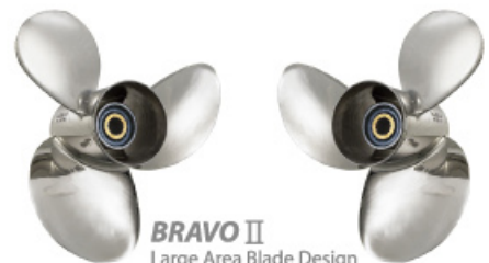
BRAVO II Large Area Blade Design

* Three blade stainless steel propeller * Improves acceleration by putting more blade area in the water. It can deliver a very powerful thrust.