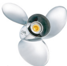
LEXOR All-around Performance