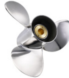
NEW SATURN All-around Performance Propeller

* Required hardware to install propeller that SOLAS makes in hub C series propeller.