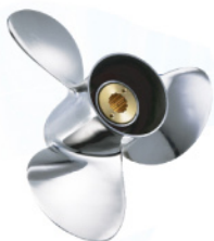
NEW SATURN All-around Performance Propeller

* Required hardware to install propeller that SOLAS makes in hub B series propeller.