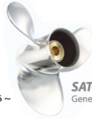
SATURN General Purpose Propeller